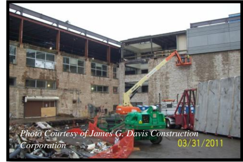
Figure 2 | Demolition of Existing Parapet for Perimeter of Main Building

7700 Arlington Blvd. is an existing structure, so there will be certain systems demolished for this project. The main materials that will be demolished include: the removal of the building façade, louvers & windows, elevator structure, interior stairs, existing penthouse structure, cafeteria, antenna room, and the existing parapet for the entire perimeter of the Main building, which is shown in the picture to the right. In addition to these materials being removed, the Main and Southwest Buildings will demolish their mechanical systems, the entire electrical & lighting system, and the plumbing and fire protection systems.