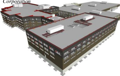
Figure 3 | 7700 Arlington Blvd. Navisworks Model